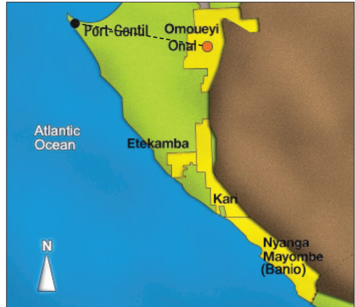
The pipeline runs from Onal to Coucal, near Port-Gentil in Gabon, on the western coast of Africa.

As part of its collaborative-solution approach, Colfax provided support for the pumping process, offering insight and information on speed regulations and startup processes. Colfax also met the demanding requirements of the customer that enabled the pumps to integrate seamlessly into the pipeline construction itself including all diameter, drain, bypass and safety specifications provided.