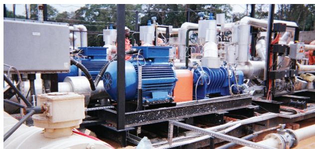
Warren® two-screw pump

The order also includes two complete skid-mounted pump systems. One system employs an Allweiler progressing cavity pump to empty a tank filled with a water-crude oil mixture. The second one provides firefighting capabilities with three Allweiler centrifugal pumps and complete automation, in accordance with French insurance industry L'Assemblée Plénière des Sociétés d'Assurance Dommage (APSAD) rules governing firefighting systems.