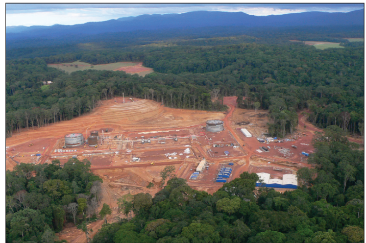
Onal, Gabon, Africa